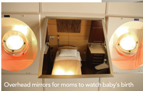
Overhead mirrors for moms to watch baby's birth