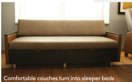
Comfortable couches turn into sleeper beds